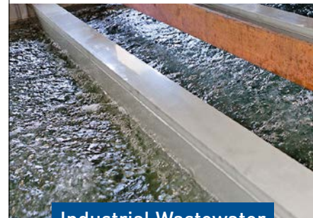
Industrial Wastewater Treatment

supply chain, such as Endurance, which are moving decisively towards the mobility of the future thanks to a forward-looking industrial vision and constant investment in innovation. ▶