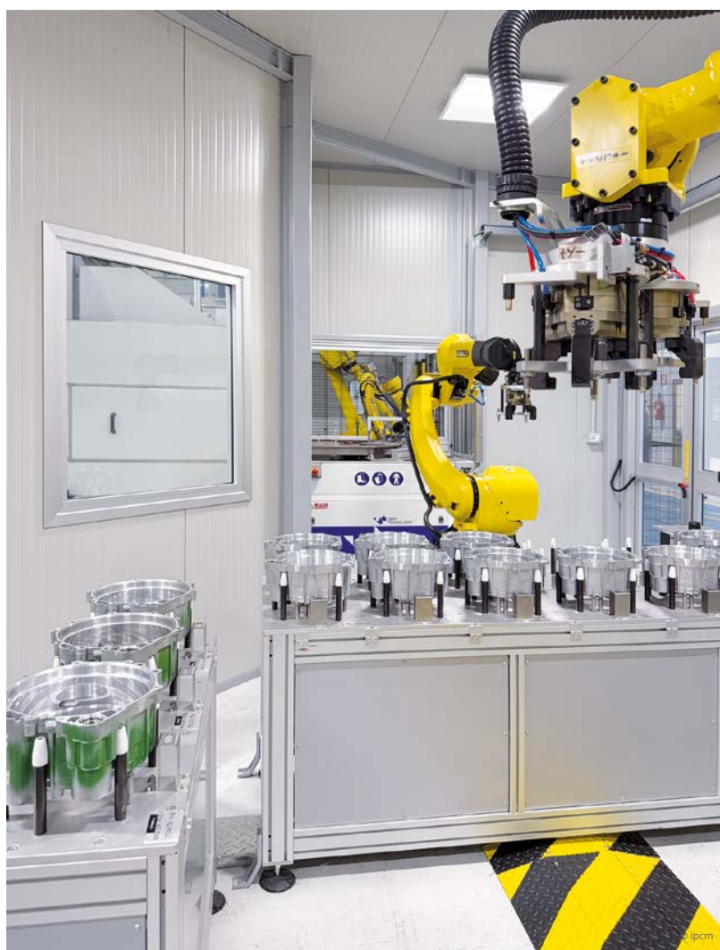
The display for controlling the cleaning phases and the manipulator at the unloading station for cleaned parts.

components intended for the automotive and agricultural industries,” says Tarditi. “Following the agreement between Fiat and General Motors in 2000 and the subsequent opening up of the American and German markets, we began supplying Opel plants in Germany. From that moment on, our development projects took on an international dimension. This prompted us to structure our company accordingly, adapting to the regulations and working methods of the automotive industry. In addition to ISO 9000 quality certification, we also obtained specific certifications for the sector, such as IATF.”