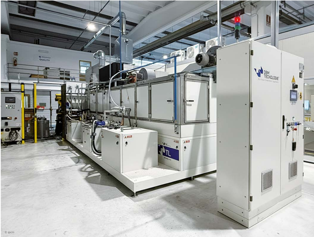
Opening photo: focused on automotive components, Endurance Overseas is the holding company that manages the Group’s operations in the EMEA region.

Endurance’s history is closely linked to that of the Turin-based car manufacturer, which guided its development through commercial agreements until at least the first decade of the 2000s. “Our business began in the 1970s with the first factories built between Chivasso and Lombardore (Turin) for foundry and machining operations on