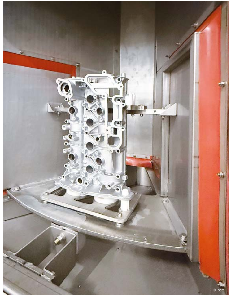
A motor component cleaned in the LST system's chamber.

the end of the cycle. The result is a level of automation that is difficult to achieve with traditional lines.” The plant, which features a horseshoe layout, was designed for cleaning simple parts, such as brackets or motor mounts, which do not require fine cleaning. After drying, the components are sent directly to the control chamber for leak testing. “The main difficulty was obtaining perfectly clean, dry, and cooled surfaces to reach a stable temperature before the parts enter the control chamber,” Costa Laia points out. “We worked intensively during the design phase to achieve the results required by Endurance, also drawing on its experience and know-how in the cleaning of mechanical components. We implemented some technical adjustments suggested by its team, which improved the machine’s accessibility and ease of use for operators and maintenance, as well as optimising the configuration of the human-machine interface.”