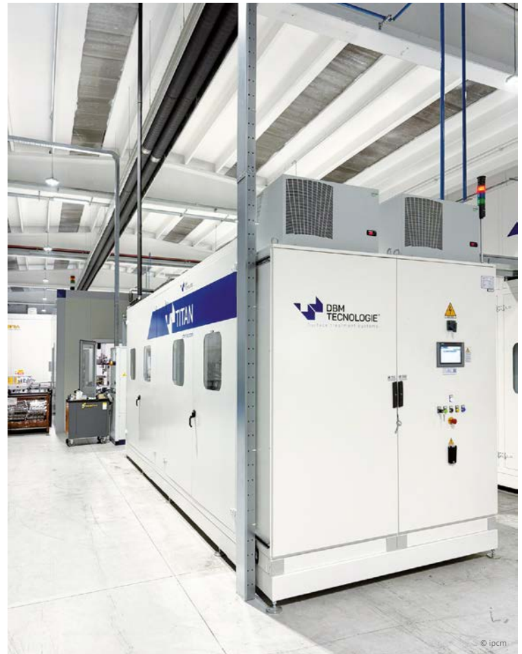
The TITAN high-pressure cleaning and deburring system.

reduction in demand for combustion engines in favour of electric motors prompted the company to convert one of those three lines to produce components for electric mobility. “However, that prediction proved to be incorrect,” notes Tarditi. “Last year, the customer asked us to increase production of the component intended for combustion engines to 24,000 pieces per week. We therefore had to design a new production line in an area of 3,500 m 2 in the Chivasso site, comprising fifteen machining systems, two cleaning systems (one performing an intermediate phase, similar to the plant installed in Lombardore, and a second one for the final cleaning stage, designed from scratch), and leak testing systems. For the cleaning operations, we turned once again to DBM Tecno-logie, with a much more complex project this time.” The two new systems were installed in July and September 2025, respectively, and marked a further step forward in the technological collaboration between these two companies.