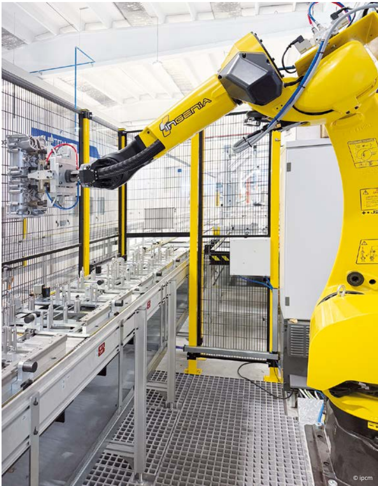
The LST system incorporates the same design principles as the tunnel installed in Lombardore, including the loading/unloading manipulator.