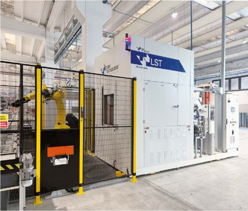
The LST series rotary table cleaning system at the site of Chivasso (Turin).